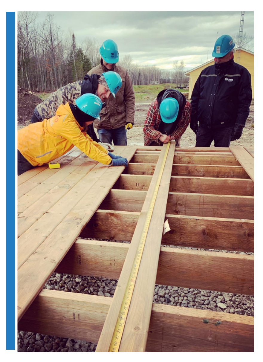
TC Energy volunteers measuring a deck to be constructed as part of the Grey Bruce Habitat for Humanity build in Chippewas of Nawash Unceded First Nation in November 2021.