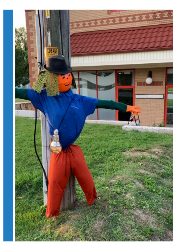
Our Community Information Centre joined the fun in the Meaford Scarecrow Invasion, which celebrated its 25th year.