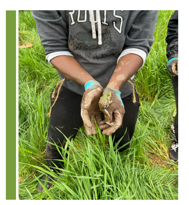
More than 20 TC Energy volunteers planted cedar saplings with Tree Canada... but not before visiting with some frogs.

Ongoing: We encourage any charitable organization based or operating in Meaford to apply for cash grants, in-kind donations or sponsorship through TC Energy's Build Strong website (www.tcenergy.com/buildstrong). It takes only minutes to fill out the online application form.